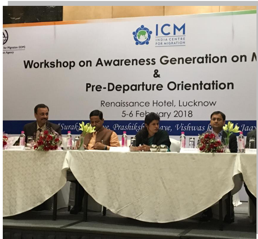
ToT Workshop held in Lucknow, 5-6 February 2018