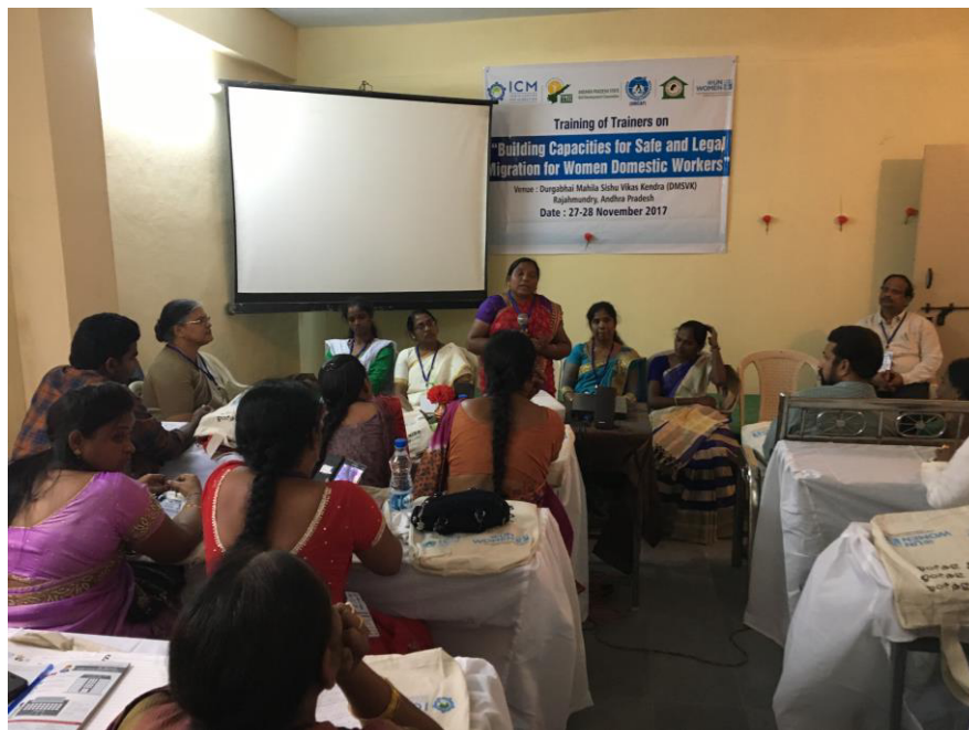
ToT Workshop held in Rajahmundry, 27-28 November 2017