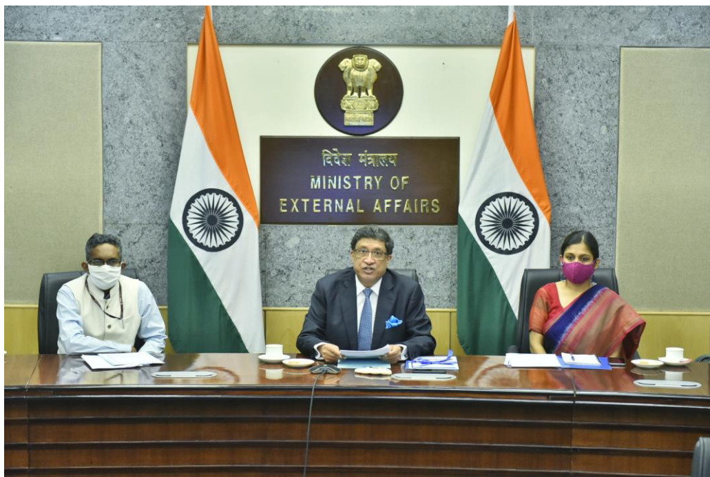
ICM – IOM Project Launch, 23 rd March 2021