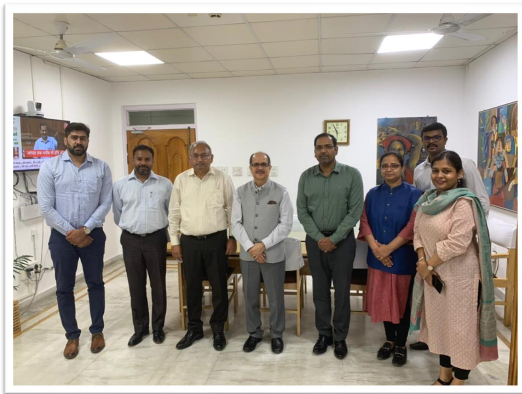
State Outreach to Tripura on 5-6 July 2022