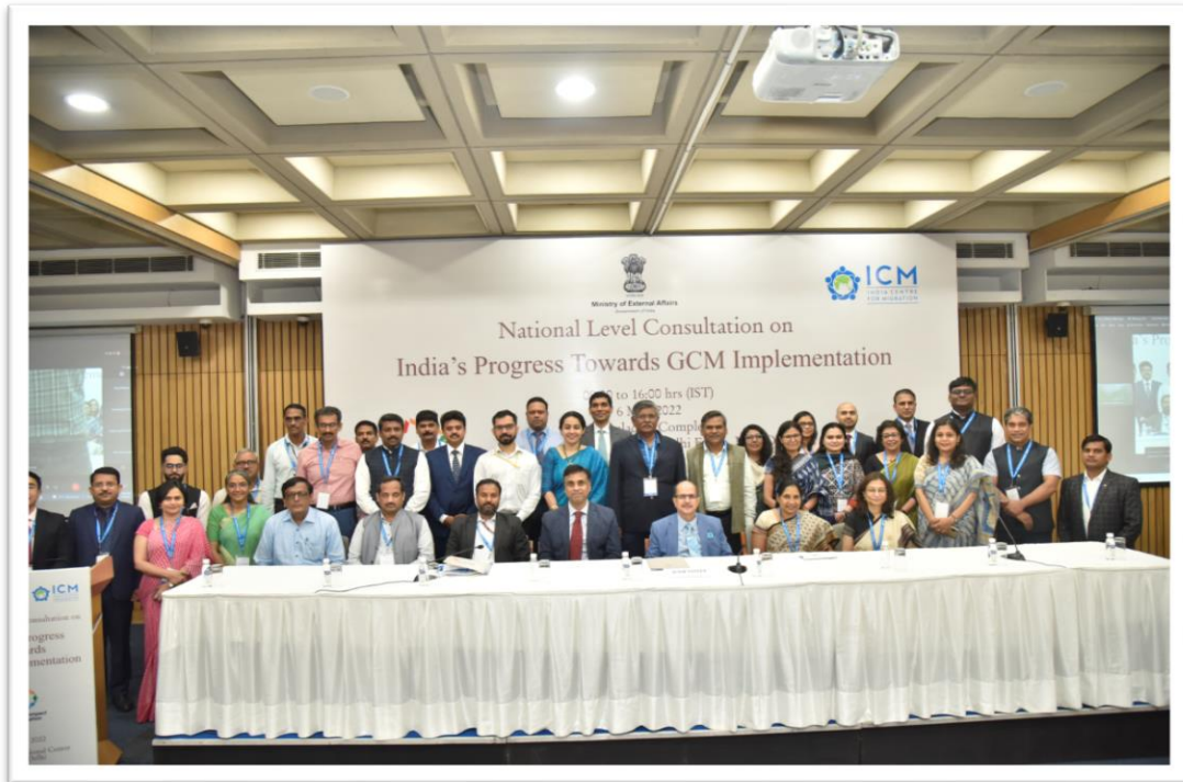
National Consultation on India's Progress towards GCM Implementation held on 6 May 2022