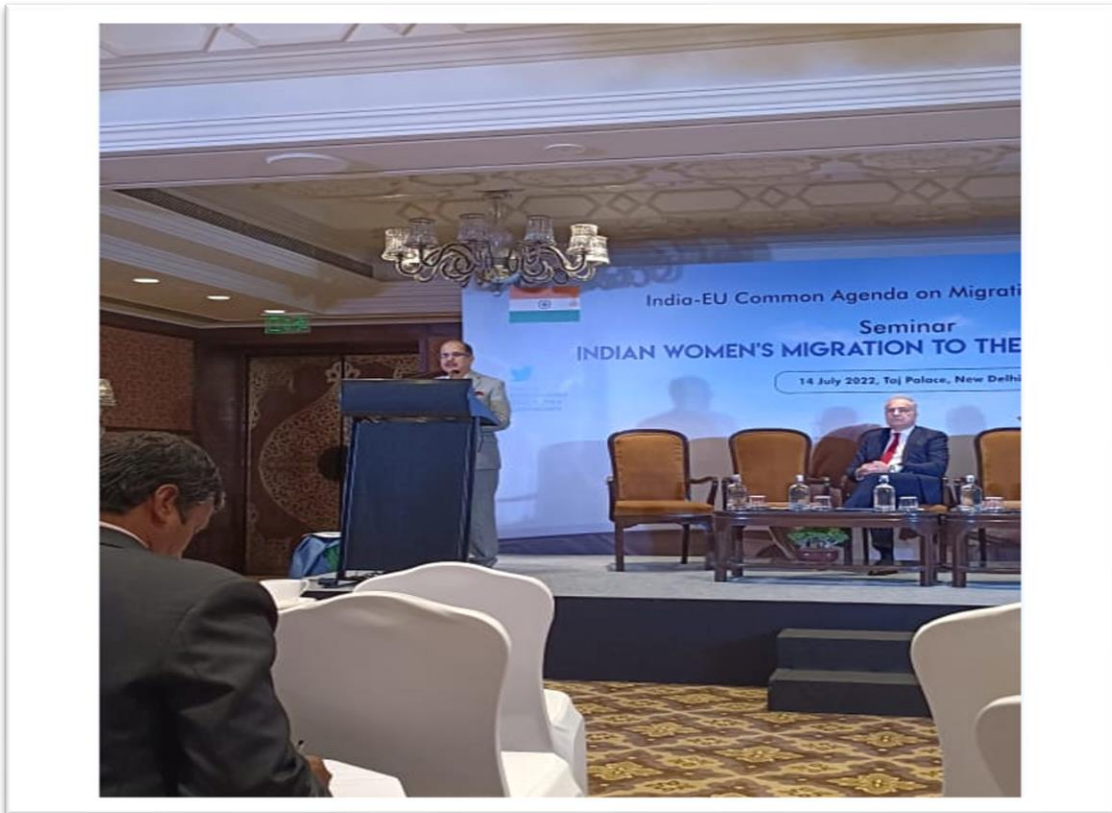
Seminar on Indian Women's Migration to the EU held on 14 July 2022