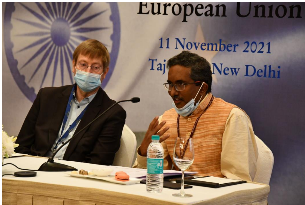
National Launch of Pre-departure Handbook for Indians Going to the European Union, 11 th November 2021