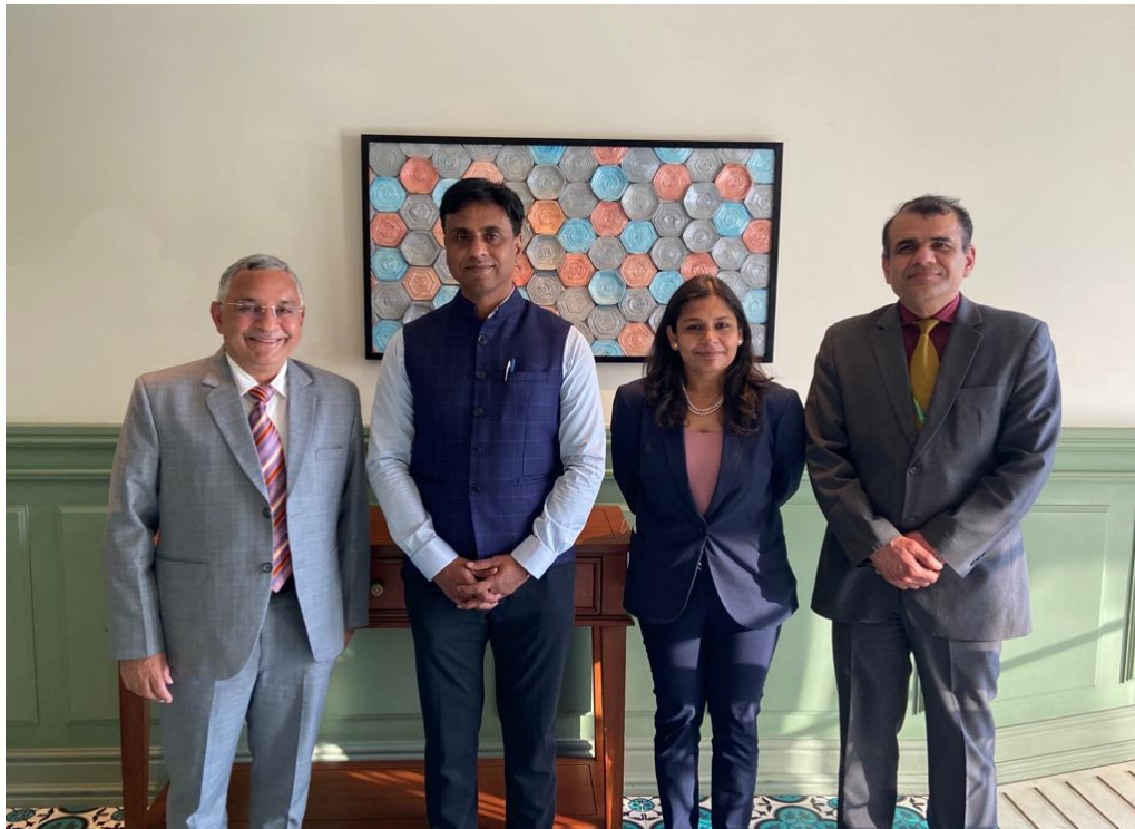
IOM Collaboration Project - 2 nd Technical Working Group Meeting, 11 th February 2022