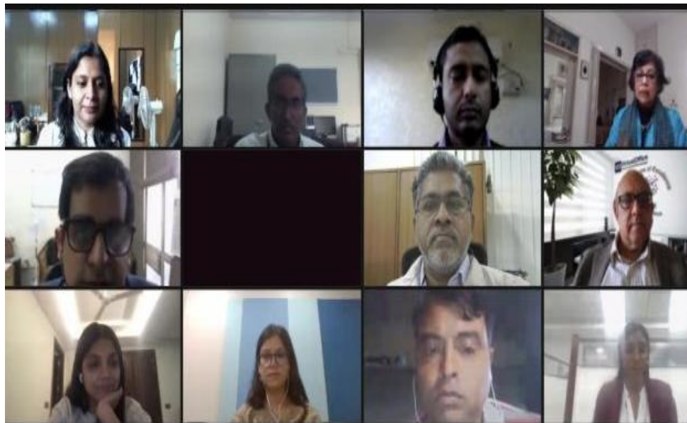
Consultation on Pathways for Aligning Skill Mapping with International Labour Market: Eastern Edition, 29 th November 2021