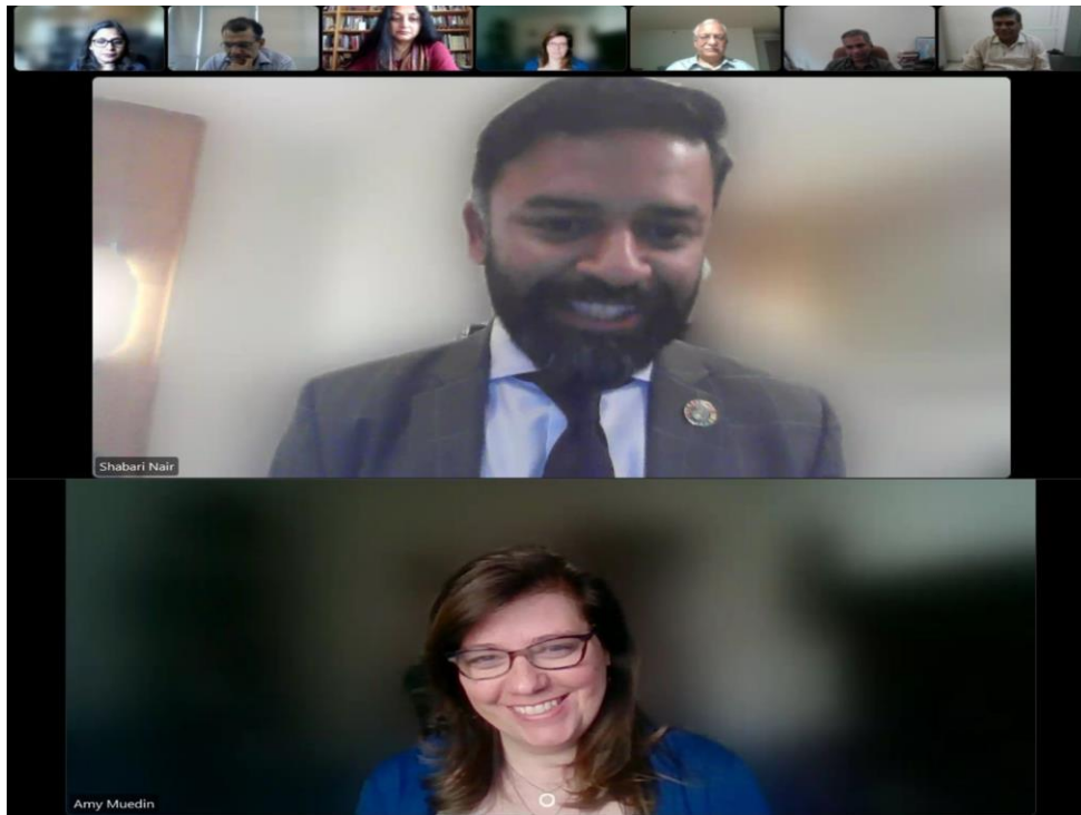
International Migration Review Forum 2022: GCM Implementation and Prospects for India, 24 th March 2022