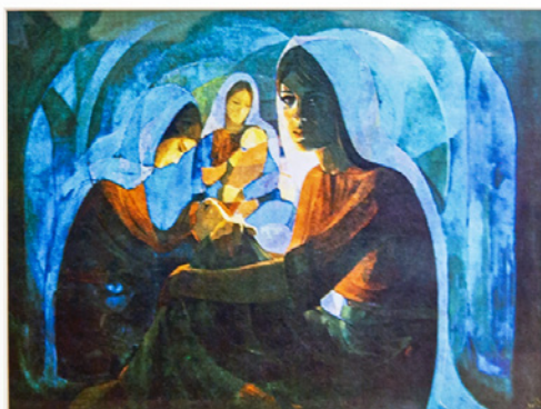
Three Tales by The Arab Palestinian Artist Ismail Shammout