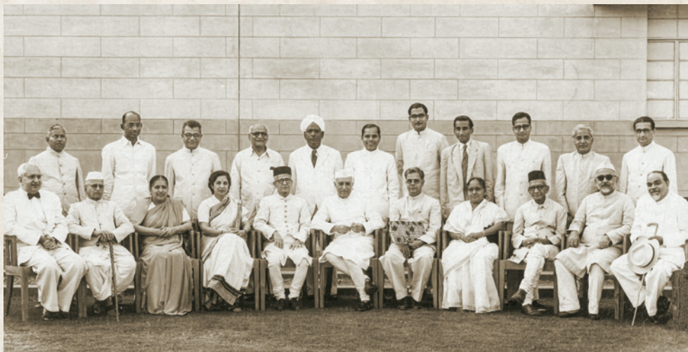
□ Members of the Executive Committee – Inauguration of Sapru House by Prime Minister Jawaharlal Nehru, 1 May 1955.