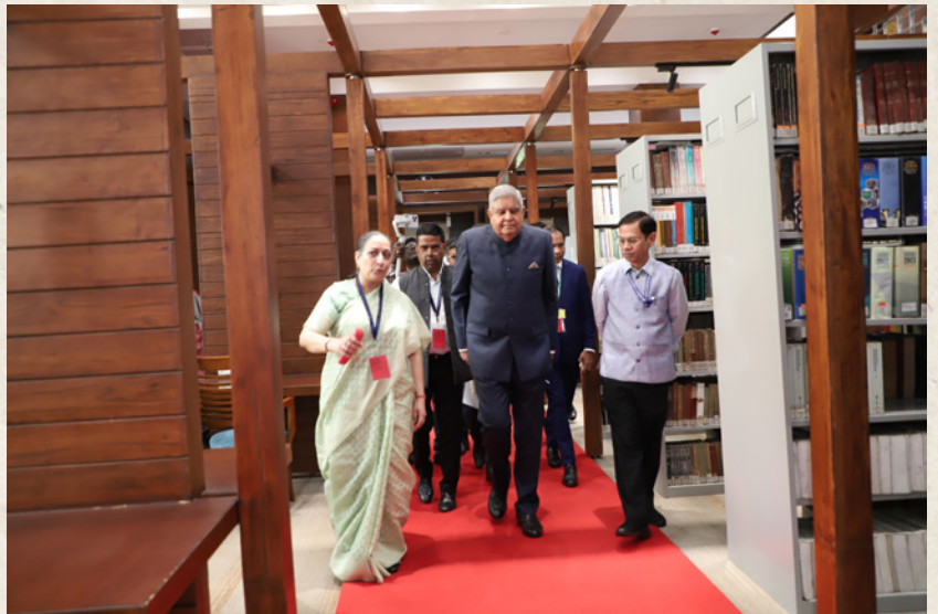
📖 Hon'ble Vice President of India and President, ICWA Shri Jagdeep Dhankhar on his Visit to Sapru House Library on 13th September 2023.