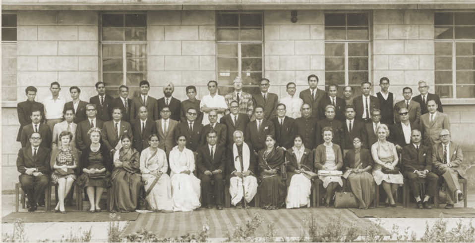
□ Seminar on 'Social Science Research and Library Development in India' organized by the Indian Council of World Affairs in cooperation with the Indian School of International Studies, 25-27 February 1967.