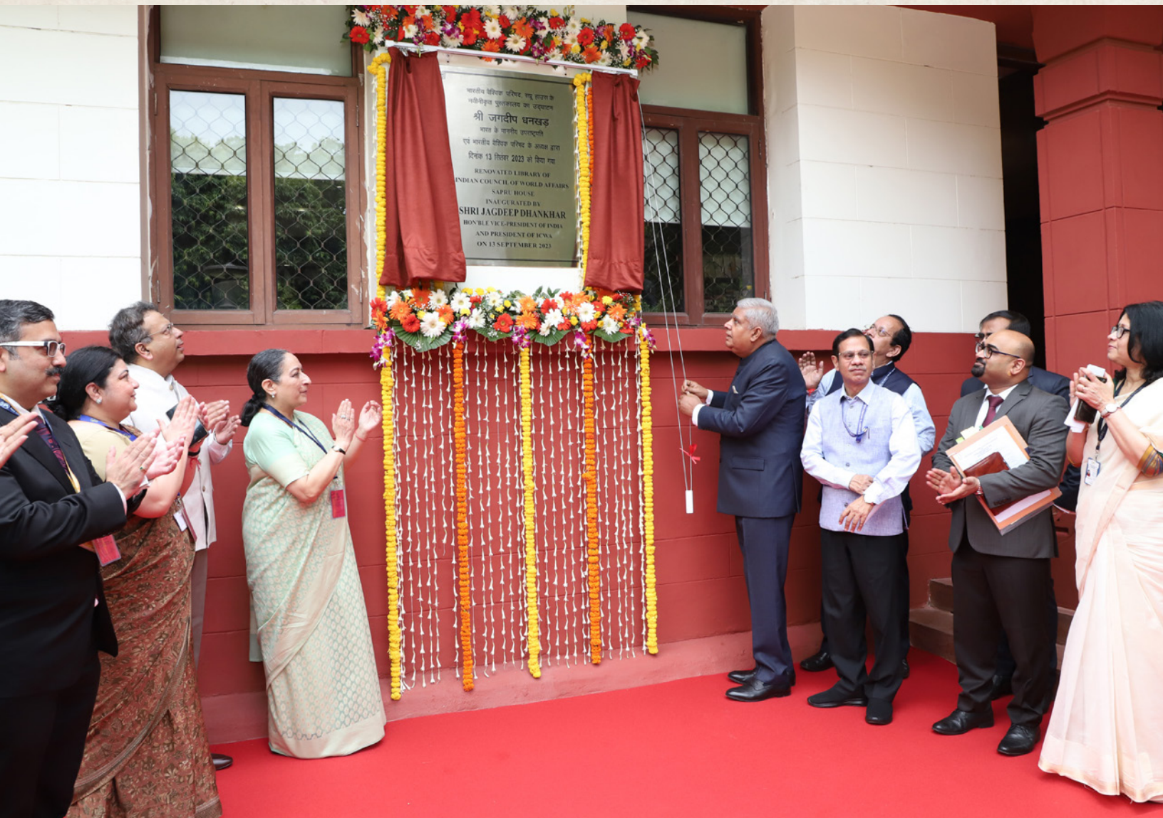
📖 Hon'ble Vice President of India and President, ICWA Shri Jagdeep Dhankhar inaugurating the renovated Sapru House Library on 13th September 2023.

Founded in 1943, the ICWA Library, also known as the Sapru House Library, traces its origins to a donation of books from the Royal Institute of International Affairs, London. This donation marked the beginning of the library's expansive collection, which has since become one of the largest in Asia, specializing in International Affairs and Area Studies.