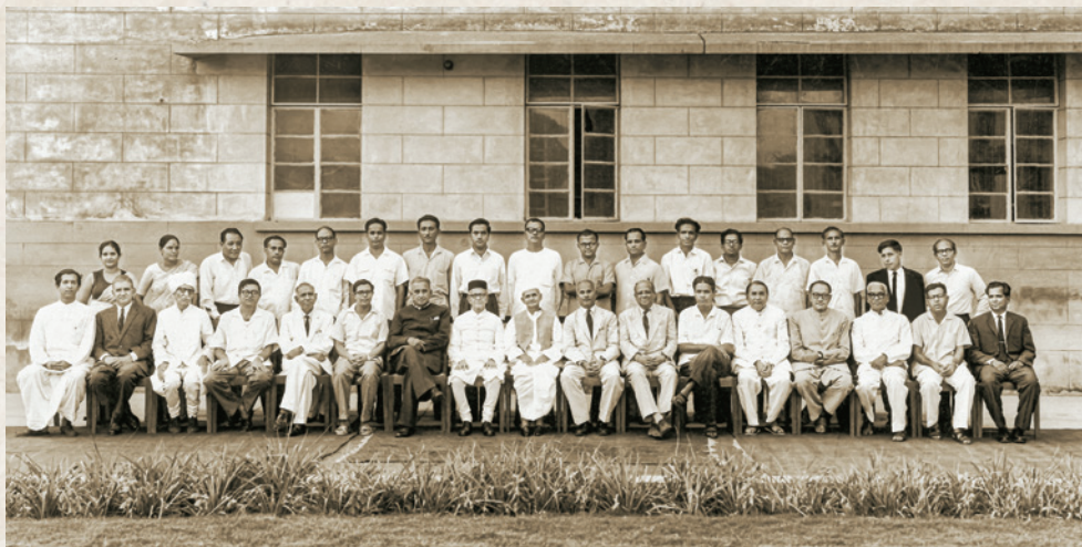
□ Prime Minister Shri Lal Bahadur Shastri's visit to the Indian School of International Studies, Sapru House, 13 August 1965.