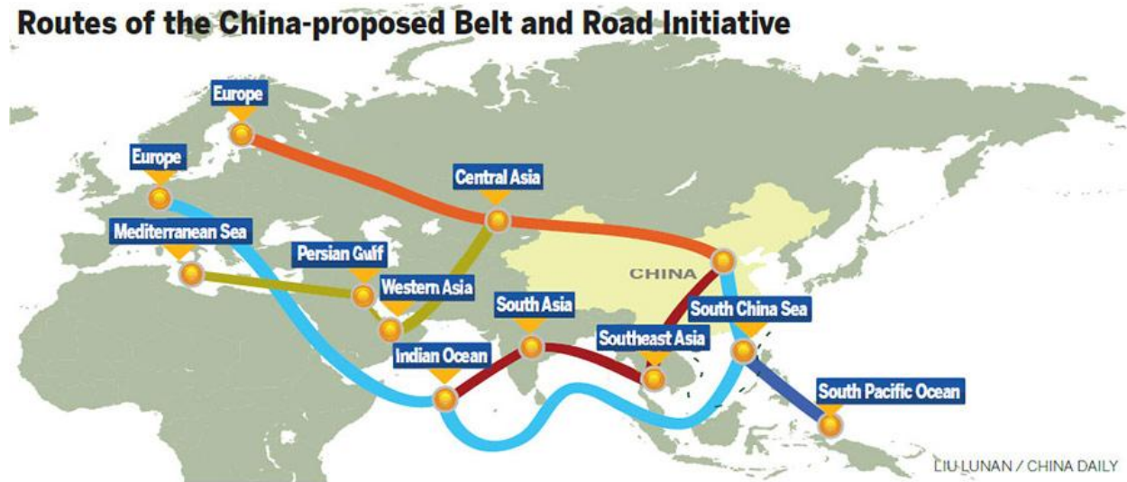
Map 2: Revised Routes of OBOR