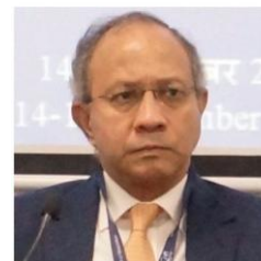
Ambassador Pankaj SARAN Deputy National Security Adviser of India

Greater cooperation between Russian regions and Indian states is another new emerging focus area of our relations. The Russian Far East, with its strategic location and abundant resources, is another area where bilateral cooperation is likely to be strengthened in the coming years provided we work hard.