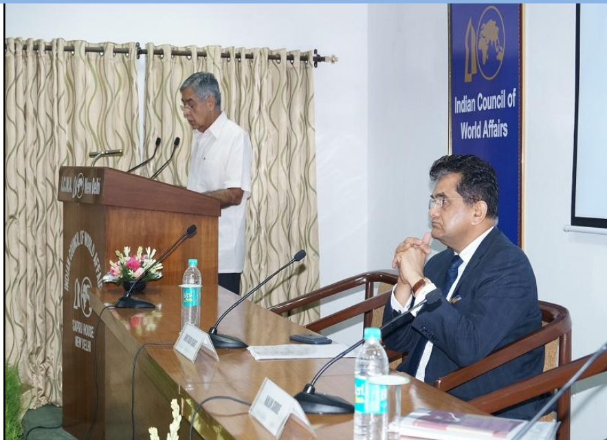
Inaugural Session with Shri Amitabh Kant, CEO, Niti Aayog

Much more international support is needed for resettlement of refugees. Thirdly, in many countries refugee protection is difficult to deliver as public opinion may go against it. Therefore States will have to develop effective mechanisms to deal with refugees. Finally, providing conditions for integration can be another solution. The issue requires political will and economic resources.