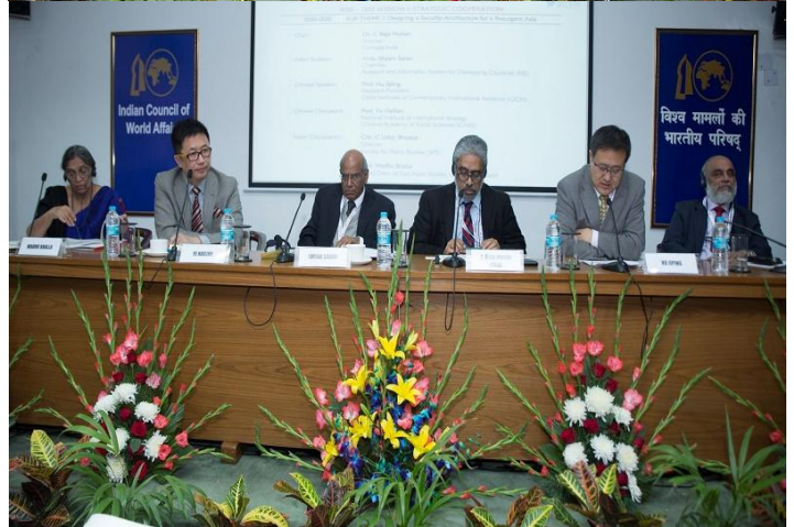
Shri M.J Akbar, Minister of State for External Affairs, Government of India, Foreign Secretary of India, S. Jaishankar, along with Chinese and Indian Delegations in the Inaugural and various Sessions of the First 'India China Think-Tanks Forum' in ICWA, Sapru House